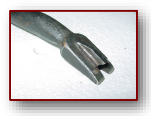
Closeup of sleeve removal tool

The simple way to evaluate a bushing is to visually inspect that area (car on the ground) while your assistant takes up the play in the steering wheel, being careful not to overdo the wheel wiggle. Watch the bolt in the bushing and see if it moves in the rubber; any movement would mean replacement is necessary. At the same time, watch where the pitman arm itself is turning in the bronze bushing at the bottom of the box. If the box itself needs adjustment you will see the pitman arm move back and forth in the bronze bushing a small amount instead of actually turning. If that is the case and adjustment does not cure the excess play, then the bronze bushing may need replacement.