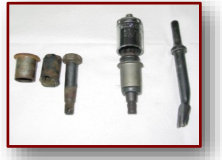
On the left is an old bushing that has been removed. In the center is a new bushing with a home made pusher. On the right is an air hammer tool for removing the sleeve from the center link.