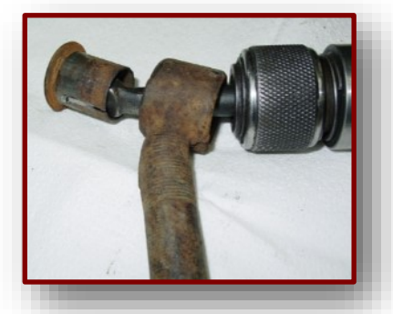
The pressed in sleeve has been removed with the center link still attached to the tie rods